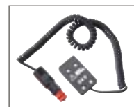
Charger for your car