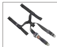
Seat belt system including hip belt